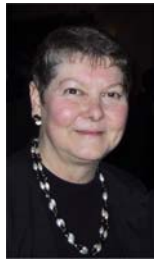
Downtown Services Manager

The Communicator is a tool for informing our members and others about the downtown Everett BIA. We began with articles about DEA management activities in the BIA, including Everpark Garage updates and other items that we believe are of interest to you. We would, of course, like to hear from you about the contents of